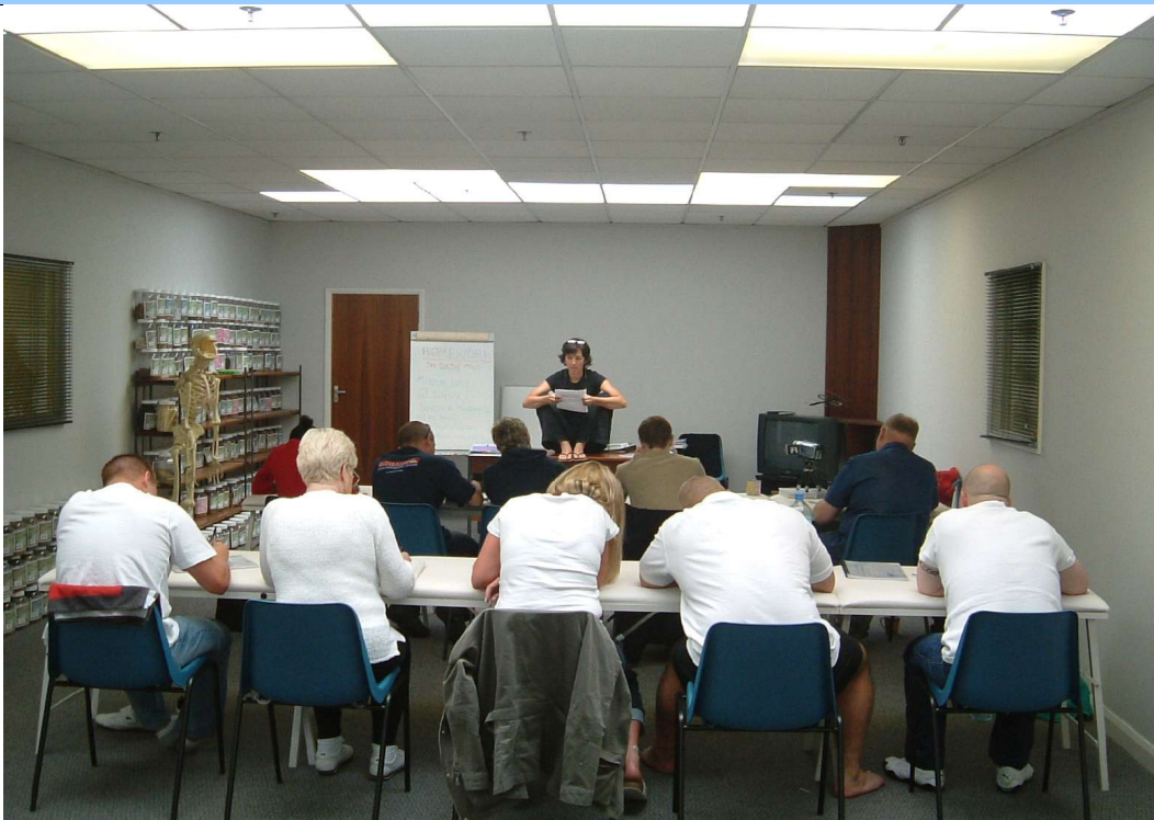
A RELAXED ATMOSPHERE IN OUR TRAINING ACADEMY

BACHELOR OF SCIENCE DEGREE IN ORIENTAL MEDICINE FROM THE AMERICAN LIBERTY UNIVERSITY DIPLOMA IN: ACUPUNCTURE & MOXIBUSTION CHINESE HERBAL MEDICINE ADVANCED TAO-YIN, INC. TUI NA ETC.